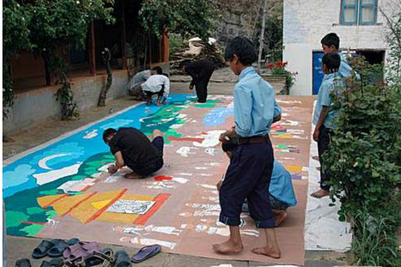
This peace mural came about due to collaboration between children from the city of Kathmandou and from a Himalayan mountain village.

In 2006, when Kids' Guernica exhibited the painting in Kastelli, Crete during Greek Easter, people who had been facing a kind of civil war for many years and in knowing that human rights had been seriously violated in Nepal took to the streets to demonstrate. Around the time when the painting was done bus services started to reach again the village but the access was still difficult. Anti-government group were living near the village.