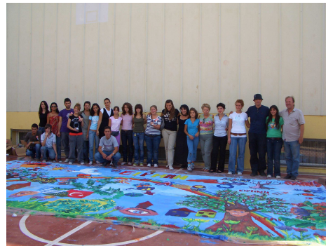
Received by Pupils of Takev School, Izmir + completed with Chios children and Students of University of Economics