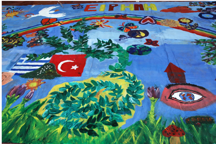
National symbols like flags surrounded by olive branches - a detail in the Chios-Turkey peace mural -

The canvas for the painting was donated by Kids' Guernica International, Japan.