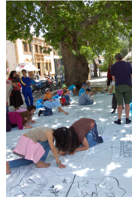
Start of the Izmir – Chios painting in Chios, Greece May 2007